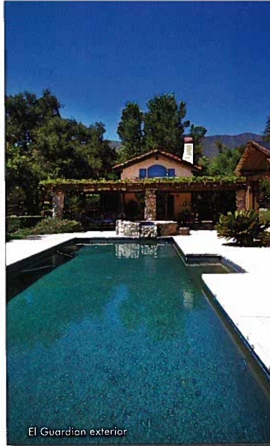
El Guardian exterior

Other houses on the tour are Villa Ravina, a Tuscan villa with breathtaking views of the Ojai mountains; El Guardian, a true reflection of the charm of European country living; and Casa Montana, a contemporary ranch house built with family in mind, that captures the particular quality of light at various times of the day.